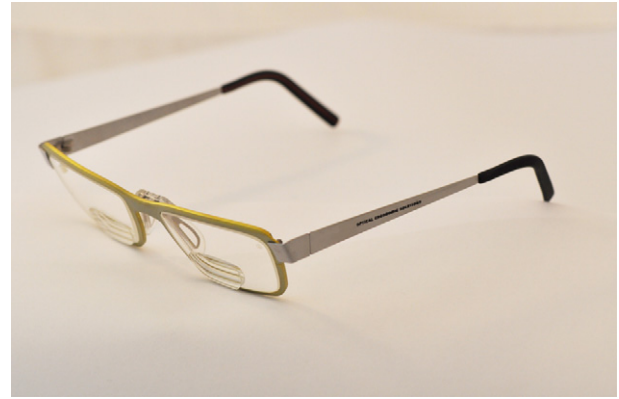
Fig. 2. Prismatic glasses with lenses located just above the lower frames.

The follow up assessments were performed between seven and eight weeks after the ergonomic information for the control group, and for the intervention group nine to eleven weeks after the first